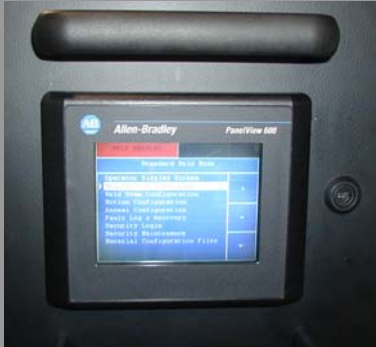
Touch Screen User Interface